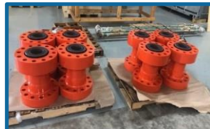
UPGRADATION & RE-CERTIFICATION AS PER AWCM 6TH EDITION