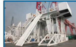
API 4F DRILLING & WELL SERVICING STRUCTURES