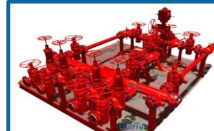
API 6A VALVES & PRESSURE CONTROL EQUIPMENT