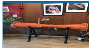
FLOW METERS & THERMOWELLS