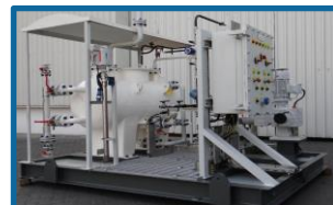
CHEMICAL INJECTION & MODULAR SKIDS