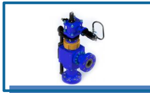
CORTEC CHOKES SERVICES