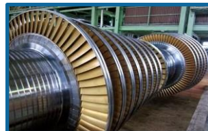
ROTATING EQUIP SERVICES