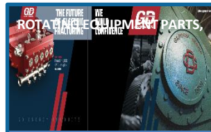
GARDNER DENVER PUMPS SERVICES