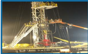
ONE STOP SHOP-SUPPLY, OPERATION & MAINTENANCE