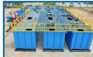
COMPLETE MUD SYSTEMS