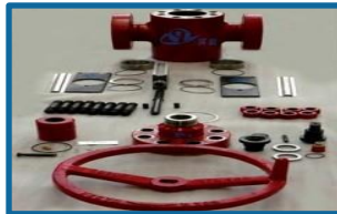
VALVES REPAIR & RE-CERTIFICATION