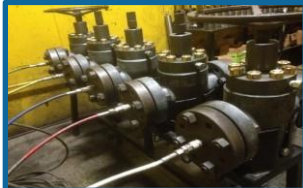
OFFSHORE, FIELD & NDT SERVICES