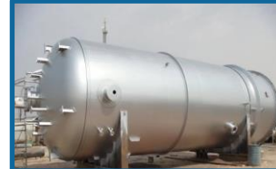
ASME PROCESS EQUIPMENT & VESSELS